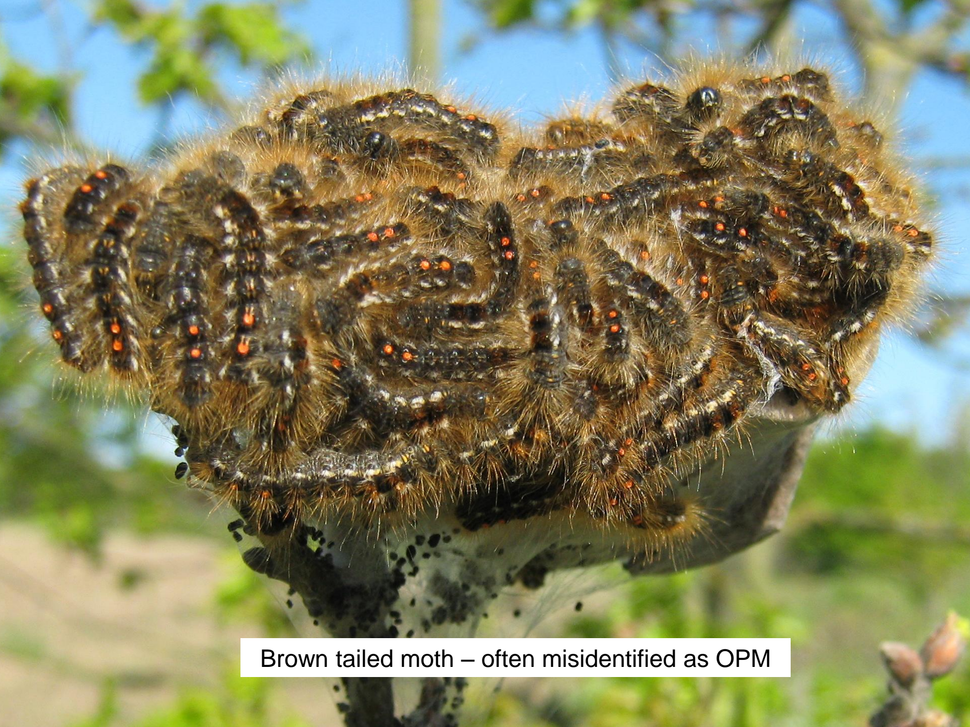
Brown tailed moth – often misidentified as OPM