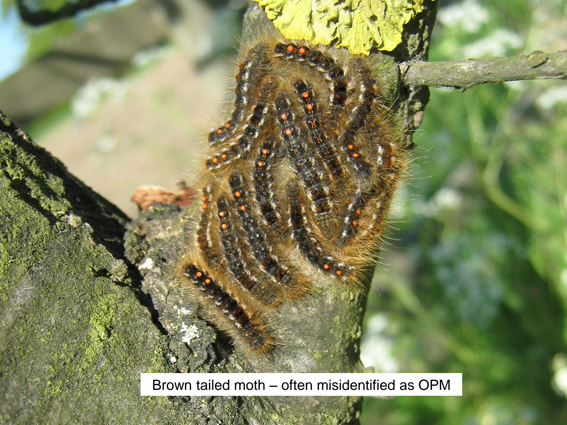
Brown tailed moth – often misidentified as OPM