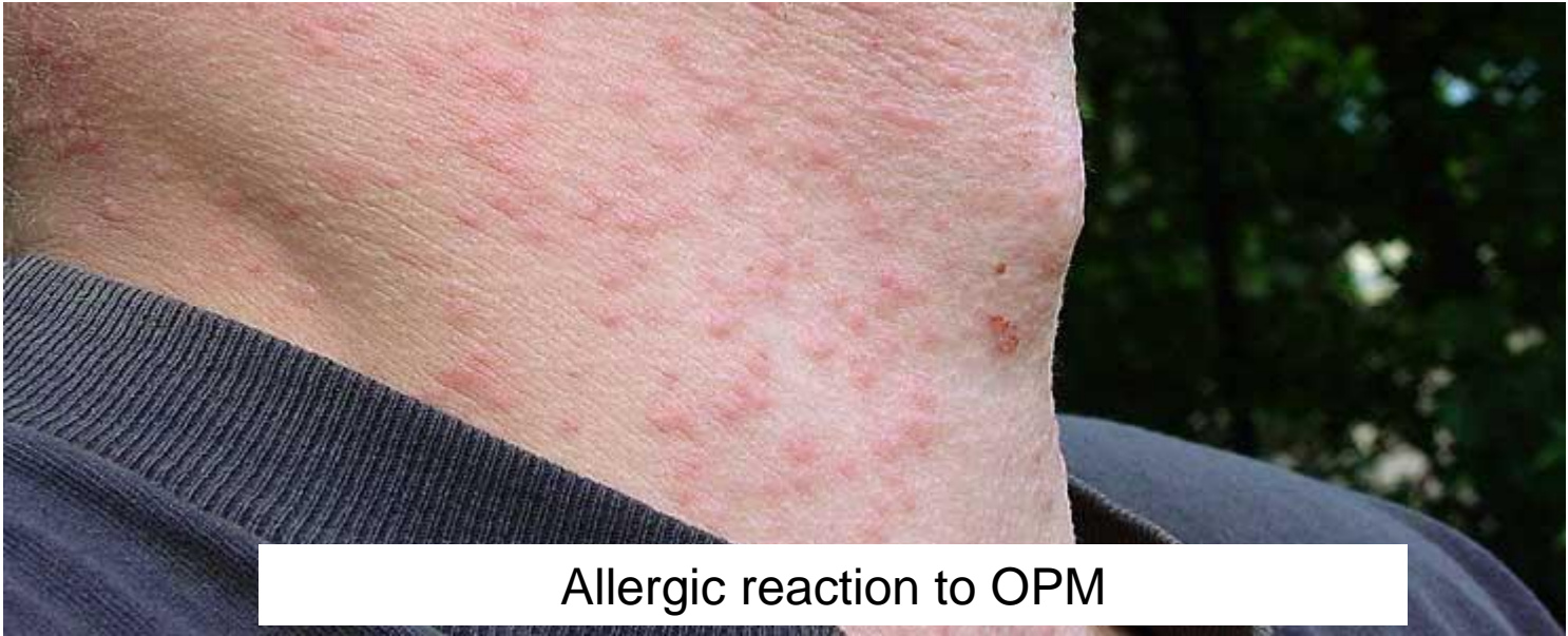
Allergic reaction to OPM